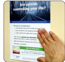
4) Apply Pressure. With a wiping motion, firmly press entire surface to activate adhesive.

For video demonstrations of specialty graphics applications, including tips and techniques, visit: amatterofgraphics.com