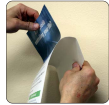
2) Peel. Begin to remove backing.