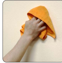
1) Surface Prep. Wipe clean.

Method: Use overlapping strokes as you apply the graphic to the surface. If you don't have an installation squeegee, a stiff plastic (like a credit card) can be helpful to smooth the graphic out during application.