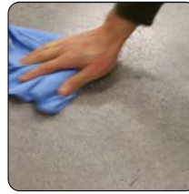
1) Surface Prep. Wipe clean.

Method: Use overlapping strokes as you apply the graphic to the surface. If you don't have an installation squeegee, your hand (open palm and fingers) can be used to apply pressure and smooth the graphic out during application.