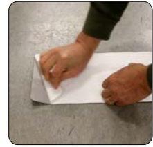
2) Peel. Begin to partially remove backing.