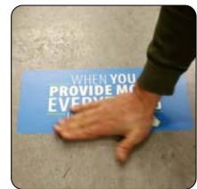
4) Apply Pressure. With a wiping motion, firmly press entire surface to activate adhesive.

For video demonstrations of specialty graphics applications, including tips and techniques, visit: amatterofgraphics.com