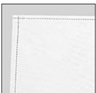
Standard Sewn Hem