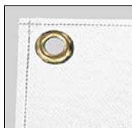
Sewn Hem & Grommets