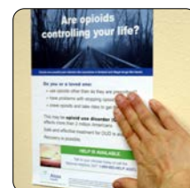
4) Apply Pressure. With a wiping motion, firmly press entire surface to activate adhesive.