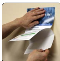
3) Stick. Use overlapping strokes to apply the graphic.