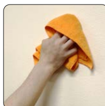
1) Surface Prep. Wipe clean.

Method: Use overlapping strokes as you apply the graphic to the surface. If you don't have an installation squeegee, your hand (open palm and fingers) can be used to apply pressure and smooth the graphic out during application.