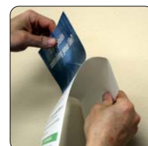
2) Peel. Begin to remove backing.