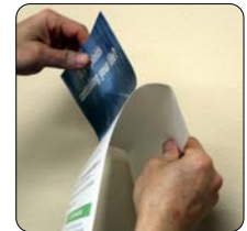
2) Peel. Begin to remove backing.