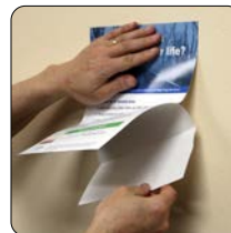
3) Stick. Use overlapping strokes to apply the graphic.