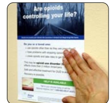
4) Apply Pressure. With a wiping motion, firmly press entire surface to activate adhesive.

For video demonstrations of specialty graphics applications, including tips and techniques, visit: amatterofgraphics.com