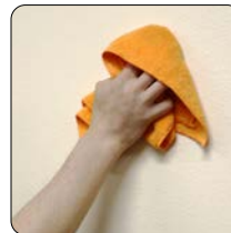
1) Surface Prep. Wipe clean.

Method: Use overlapping strokes as you apply the graphic to the surface. If you don't have an installation squeegee, a stiff plastic (like a credit card) can be helpful to smooth the graphic out during application.