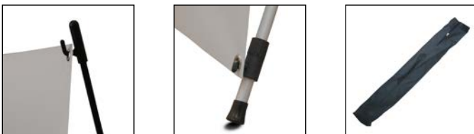
Table Top: 11" x 15"

Designed for those occasions requiring fast set-up, dynamic graphics and portability. This sturdy, lightweight stand takes just moments to assemble making it perfect for virtually any sales presentation, product launch or special event. Replacement banners make this ideal for ongoing message marketing. It's a smart solution that doesn't break the bank.