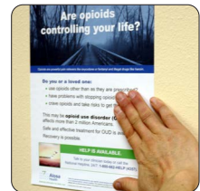
4) Apply Pressure. With a wiping motion, firmly press entire surface to activate adhesive.