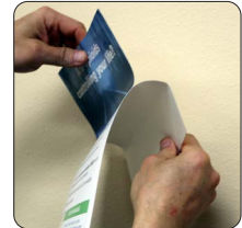
2) Peel. Begin to remove backing.