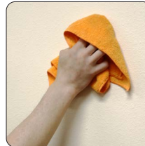
1) Surface Prep. Wipe clean.

For video demonstrations of specialty graphics applications, including tips and techniques, visit: amatterofgraphics.com